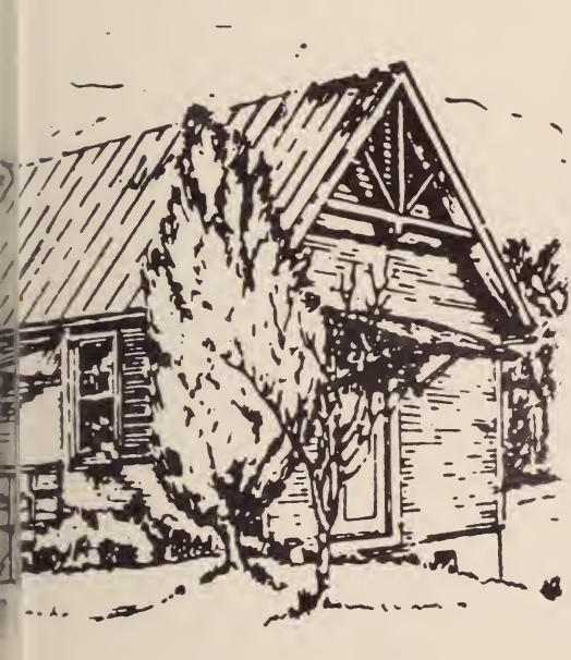
n ved to Sandy Spring Friends Crrently being used by students in for Worship.

To be more receptive to revelation, Friends practice simplicity and integrity. For Friends, simplicity is putting God first in one's life. Simplicity requires clear prioriies and often inspires plainness and lack of clutter. Simplicity persuades one to affirm, not to flatter or overplay words or emotions, and to avoid extravagance and